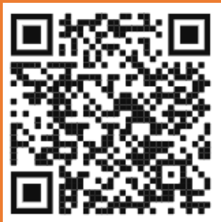
Food Miles calculator