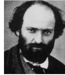
Paul Cezanne and a piece of his artwork.