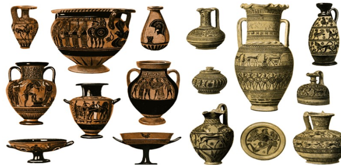
Ancient Greek pottery