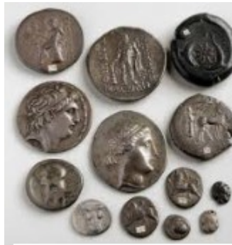
Ancient Greek coins