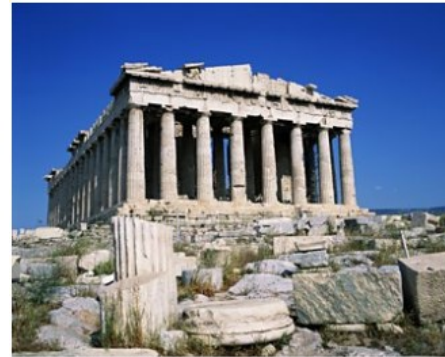
The Parthenon temple was built for the Greek goddess Athena. It sits on top of a hill called the Acropolis and looks out over the city of Athens.