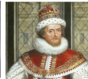
King James I